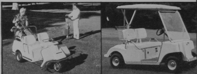
AMF Harley-Davidson DE-3 Club Car, Inc.