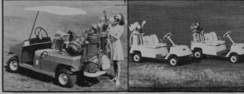
Taylor Dunn Mfg. Co. Yamaha Motor Corp., U.S.