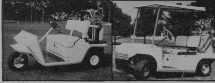
Melex Model 112 Nordco 4-Runner