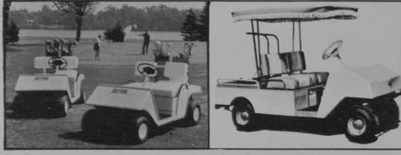
Go-Fore Laher Spring & Electric Car Corp.