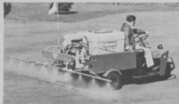
TL10 and 40 Series