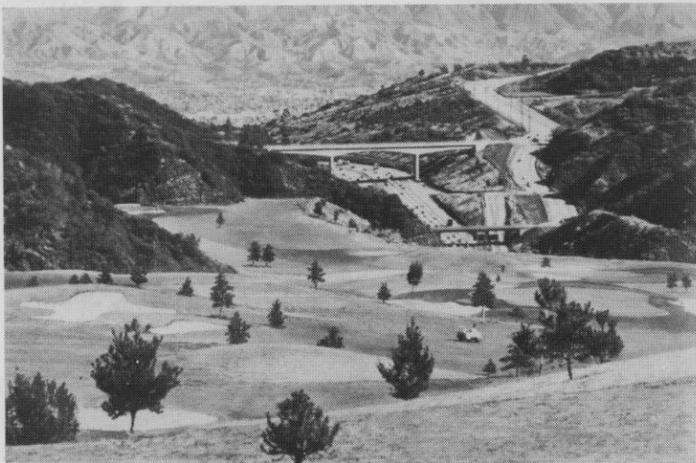
MountainGate: first new club of its type in its area in 25 years.

The company plans a gradual conversion of its other wine sizes over the next two years. The present quart will become a liter, the fifth will become the 750-milliliter size, the "tenth" will have 375 milliliters, the "split" will be 187 milliliters, and the "miniature" size will contain 100 milliliters.