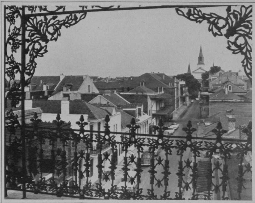
Lacey iron scrollwork adorns many of the buildings in the Quarter.