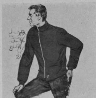
E-Z-GO GT-7 TRUCK CUSHMAN 1967 TROPHY IZOD ODLO JACKET