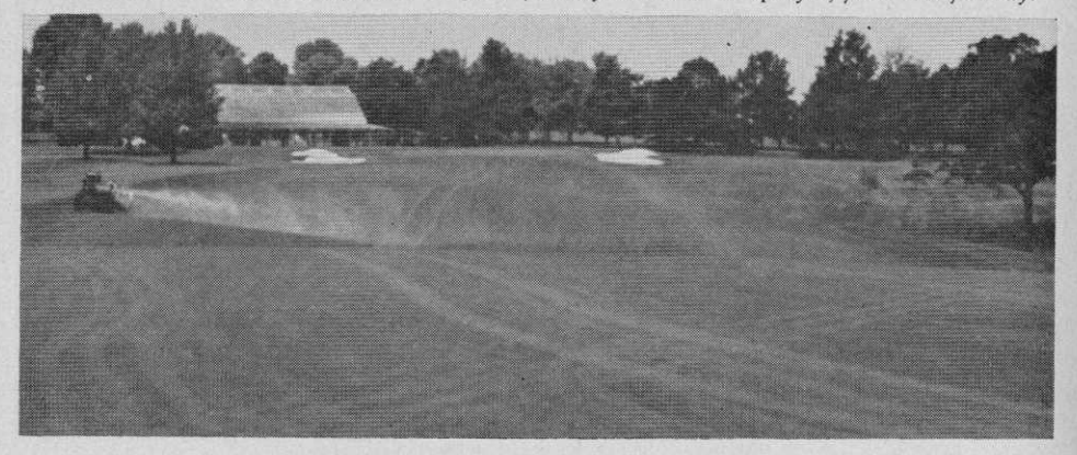
With mist blower, you spray from rough to fairway. With boom sprayer, from wet fairway.