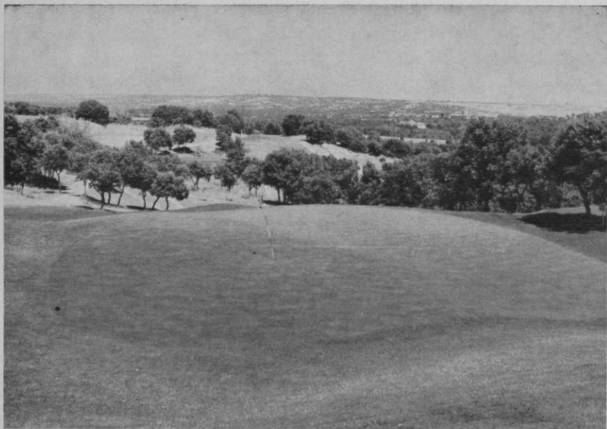
Greens, around 8,000 feet square, at Soto Grande have been planted to Penncross. Gibraltar can be seen from this spot on a clear day.

that every hole is a challenge when played from the back. But they are a fair test for the average golfer when the markers are placed up front.