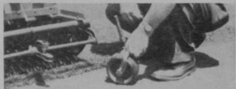
Spiker ready for action after removing the transport caster.