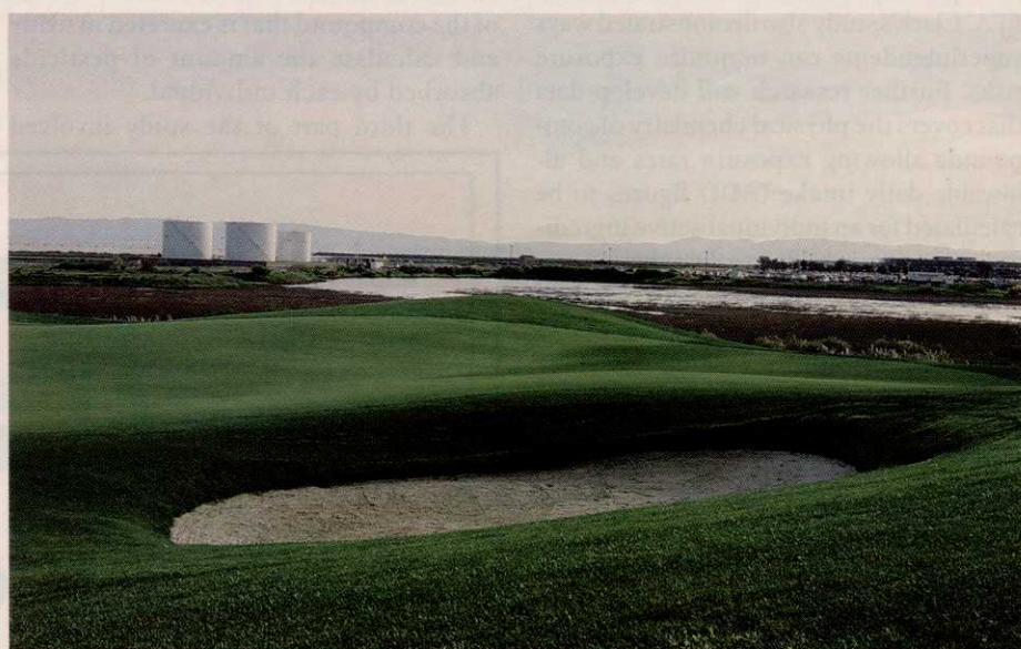
Oakland's reconstruction of the old Lew Galbraith Golf Course is complete and the course reopened in April.

The old Lew Galbraith Golf Course provided the first golf experience for thousands in the Bay Area during its 30 years of existence. But the course was built over a landfill that was mandated by the EPA to be closed down properly in 1992. This closure process called for capping the old