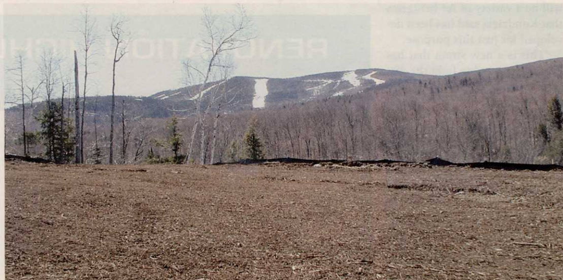
Harris Golf has commenced construction at Sunday River Golf Club, which promises to offer views of the surrounding mountains.