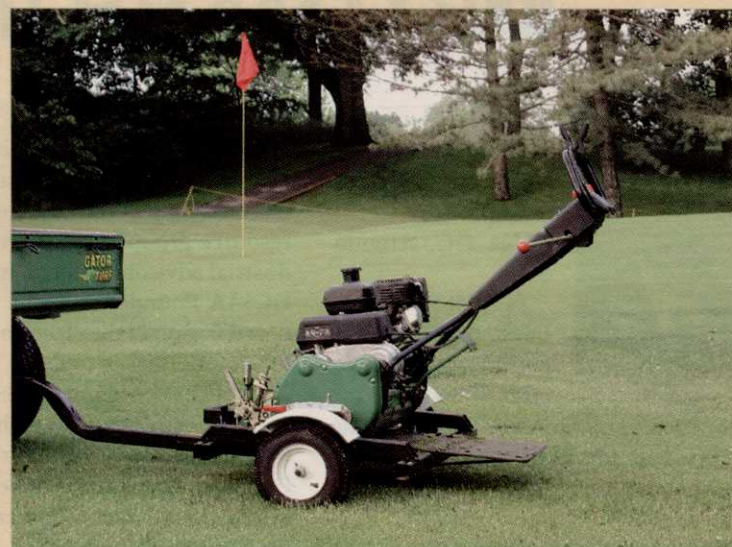
MoKart makes unloading and loading greens mowers a snap.

For more information, contact: 800-477-8415 or www.dakotapeat.com .