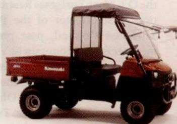
The Mule's new one-piece windshield

Kawasaki has introduced a flip-up windshield for its Mule 3000 Series utility vehicle. The seamless one-piece design allows full opening of storage space and features gas assist shocks with a locking ventilation position. The windshield can be used along with a hard plastic top or a fabric top. Maximum open trailer towing speed is 65 mph. For more information contact a Kawasaki dealer or www.buykawasaki.com .