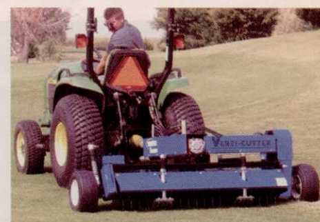
Goossen's new PTO-powered verticutter

Goossen is ready with its new PTO-powered pull unit for verticutting, dethatching, renovating and preparation for overseeding. The unit features 540 rpm power take-off, a heavy-duty right angle gearbox, #60 chain drive with shear bolt and a 60-inch-wide swath. It has 40 blades, spaced at one-and-a-half-inches, that are made of 12 inch diameter steel. The blades are adjustable for precision depth control and feature hydraulic lift for transport. For more information, contact 800-835-1042.