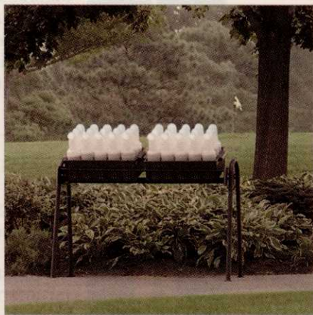
Standard Golf's Seed and Soil Bottle Rack

For more information, contact: 866-743-9733 or www.standardgolf.com .