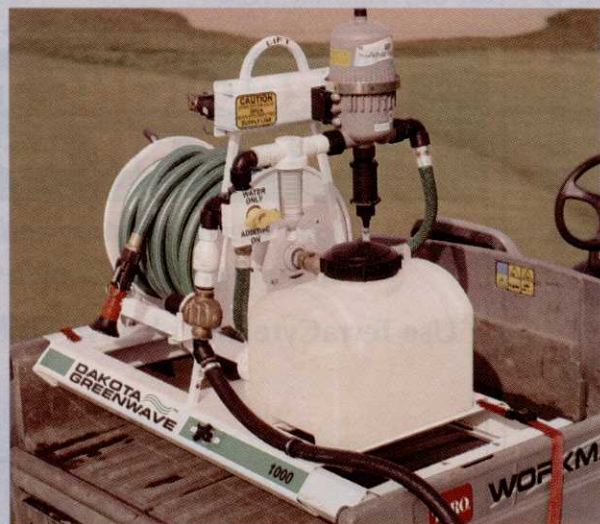
Dakota Peat & Equipment's portable syringing unit.

For more information, contact: 800-342-6173.