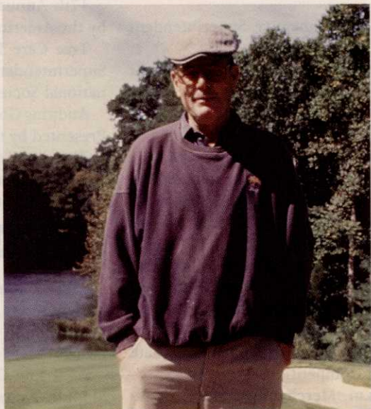
Pete Dye's career has spanned six decades

of the game in a manner and style exemplified by Old Tom Morris." Past winners include Arnold Palmer, Robert Trent Jones, Tom Fazio, Byron Nelson and Ben Crenshaw.