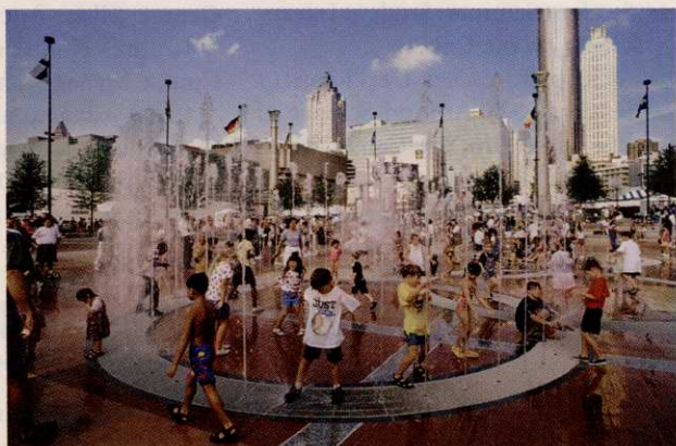
The Fountain of Rings in Atlanta's new Centennial Olympic Park

However, what hasn't changed is Atlanta's sense of history and its world-famous Southern hospitality. Below is a quick look at where to eat and what to do in the South's most cosmopolitan city.