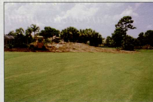
Creation of a more visible fairway bunker complex on the 17th hole was completed by generating all of the necessary fill from on-site.