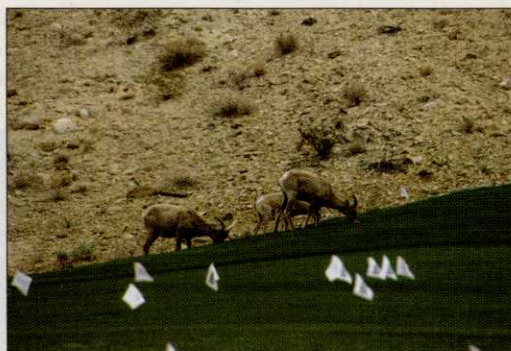
Big-horned sheep roam the grounds of the Tom Weiskopf-designed Falls Course at Lake Las Vegas Resort, the third of potentially six courses to be built on the site.