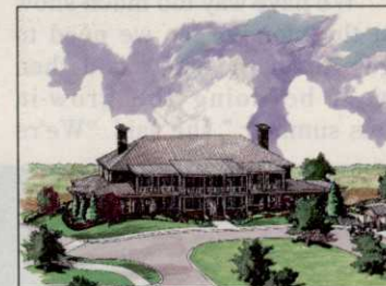
The planned clubhouse at Twin Creeks.

the homeowner's standpoint it's nice because they're up a little higher and they get the long Texas hill country views as well