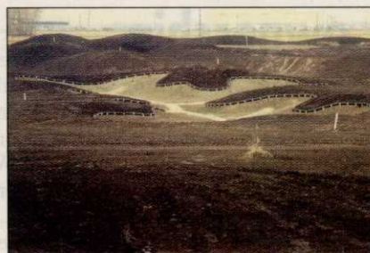
The 16th hole at RedTail Landing, prior to seeding that will take place as soon as the snow melts.