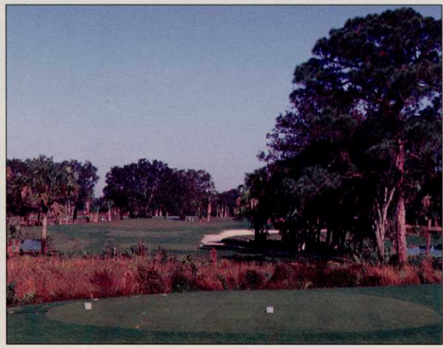
The Ted McAnlis-designed Preserve at Tara in Bradenton, Fla., is one of three new courses in Summit Golfs portfolio.

"The golf business is struggling and when that happens it benefits good operators like Summit Golf. When times are lean you have to watch costs. Clubs will have to evaluate