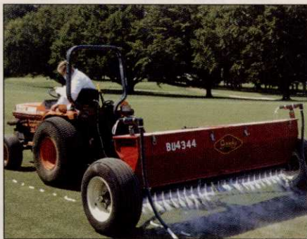
A grounds worker applies Basamid with a drop spreader for turf fumigation.