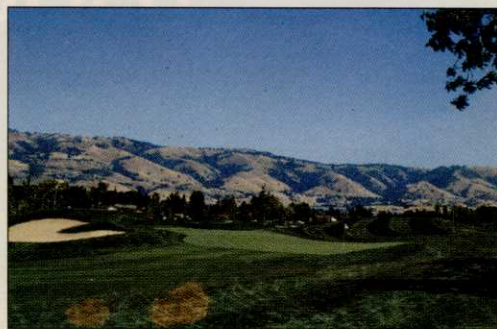
Fifteen years and an estimated $25 million later, San Jose's Los Lagos has become a reality and has been well received by players since opening in April.

the banks of Coyote Creek will preserve the sensitive lands from the unsightly illegal dumping and other activities that had overrun the area.