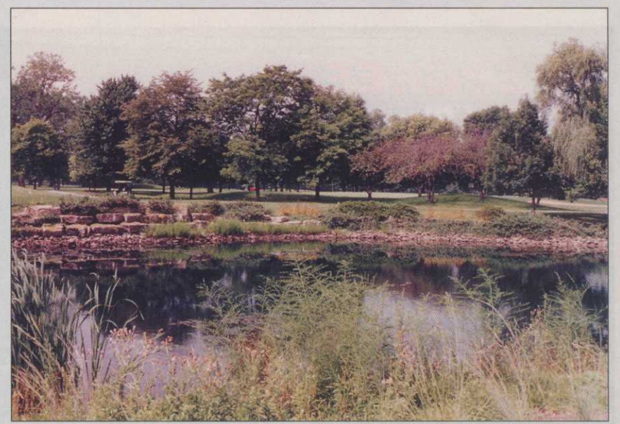
Native areas were established around the pond along the eighth hole at Bryn Mawr CC

Located across from the Chicago city limits, the private club was built in 1919