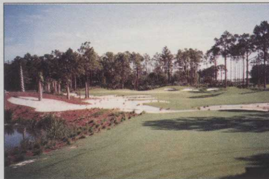
Number four at The Links at Madison Green, a par-3 hole playing from 219 yards down to 118 yards