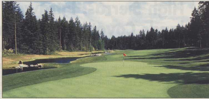
The fourth hole at the Meriwood course, part of a master-planned community

In addition to the Indian Summer course and the recent acquisitions, the Oki portfolio also includes four other courses in Washington state – one private and three daily-fee. The public Golf