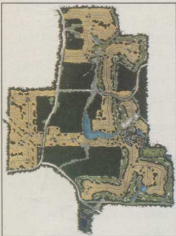
Rendering of The Manor G&CC

Watson, who holds 35 PGA titles including eight majors, only designs two courses a year. The Manor layout will play