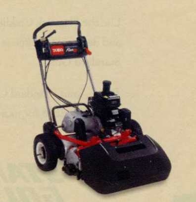
Toro<sup>®</sup> Greensmaster<sup>®</sup> Flex 21: The only greens mower that flexes with the contour of greens to virtually eliminate scalping.

Toro® Prism®: Palm size control that interacts with your Toro® SitePro® control system to manage your irrigation system quickly and accurately from the field.