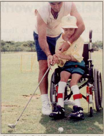
Children's Golf Foundation teaches the game of golf to handicapped kids.

"We know what the kids are capable of," he said. "We left out