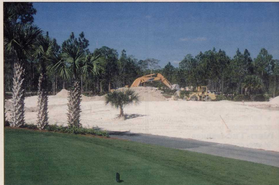
Construction is under way at the North Course at Mediterra.