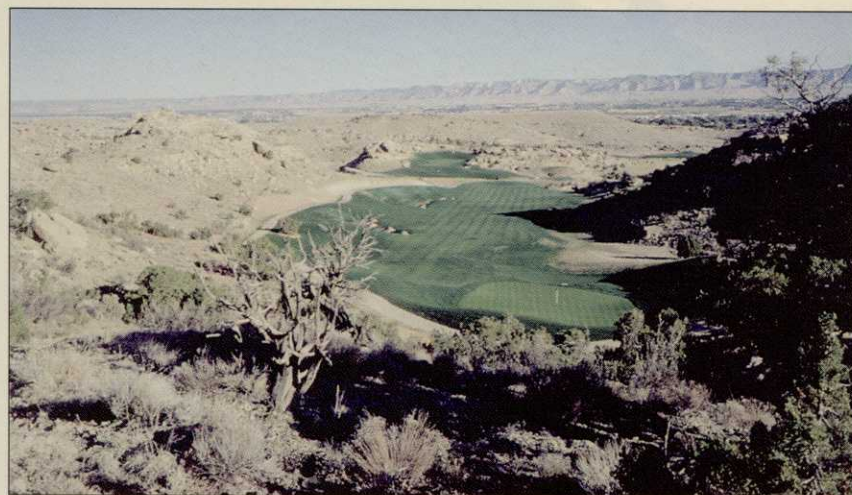
The 18th hole at Redlands Mesa