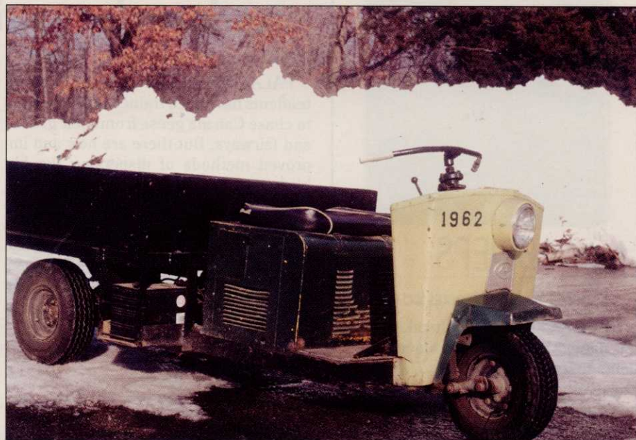
1962 Cushman Turf-Truckster, Tyler's oldest piece of equipment

world will be watching. It's a pretty awesome responsibility, but we welcome it," he said.