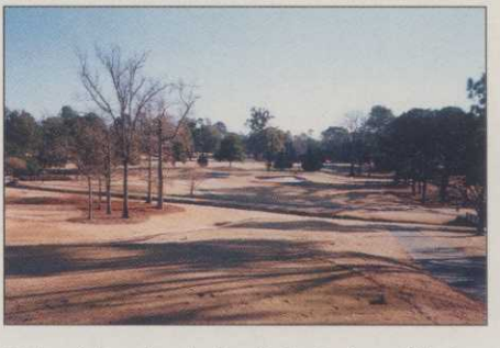
Before (above) and after (below) views of the par-3 fifth hole at the Country Club of Mobile. Note the change in bunker style.