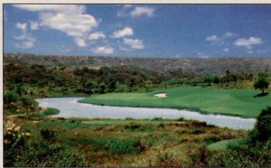
The 17th hole at The Meadows Del Mar Golf Club

On that opening night, CMAA members and guests will experience a montage of culture and art at "A Tapestry of Treasures"