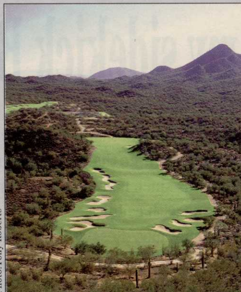
The 14th hole at the Founders Club at Quintero Golf & Country Club, northwest of Phoenix