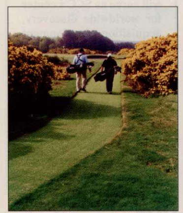
Huxley's walkway on the 8th hole at Carnoustie

The first Huxley Golf installation at Carnoustie was a 100-yard long by two-yard wide allweather pathway on the eighth hole. Previously constructed us-