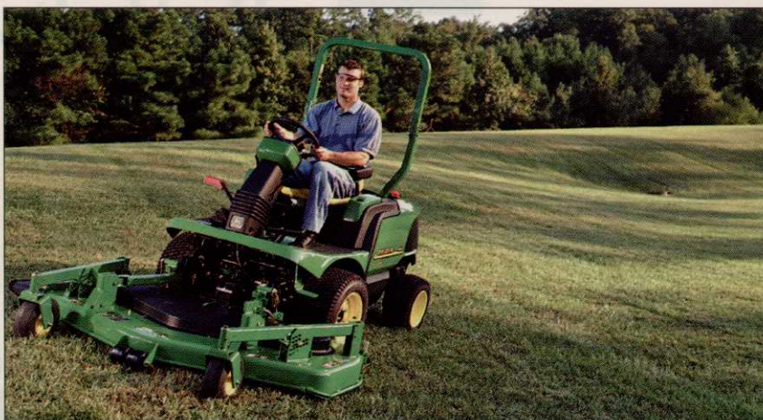
THE JOHN DEERE 1445 FRONT MOWER

The John Deere 1420, 1435 and 1445 front mower models deliver excellent traction, maneuverability and productivity. Liquid-cooled Yanmar engines power all three mowers. The 1400 Series includes the 28-hp, gas 1420, the 24-hp, diesel 1435, and the 31-hp, diesel 1445. The hydraulic PTO allows gradual engagement and smoother operation and the 14.5-gallon fuel tank allows for all-day mowing. For additional productivity, the mowers are available with 60- and 72-inch, side-discharge decks. The decks have increased airflow so more material can be processed and the operator can mow at speeds up to 12 mph.