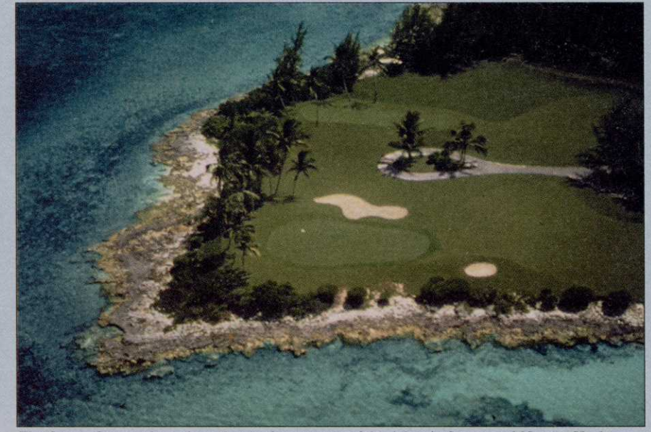
The Ocean Course plays along the cerulean waters of the Atlantic Ocean and Nassau Harbour.