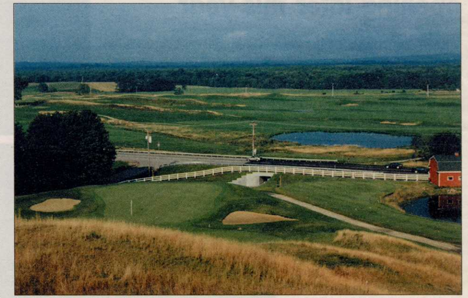
The outlook from the 17th fairway affords views of the 17th green and the links layout of the front nine.

Designed with 11 holes of rolling mounds, fescue grass, and strategically