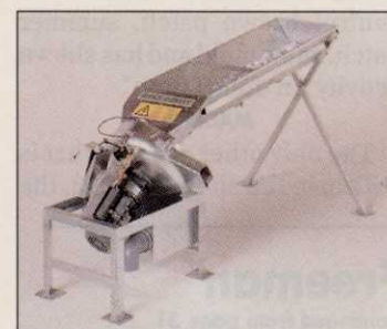
The BT-1300 ball washer

Range Servant introduces a ball washer designed for smaller stand-alone ranges. The BT-1300, a scaled down version of the bigger BT-1950, uses a scrub and rinse system where fresh water jets and a