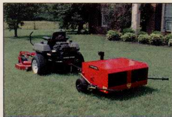
The Turf-Aire aerator

Bishop Enterprises has launched an aeration equipment line – Turf-Aire. Offering eight models ranging from 36- to 60-inch economy and heavy-duty models (three-point hitch or tow models), Turf-Aire is geared to fit commercial user's needs. It's sleek