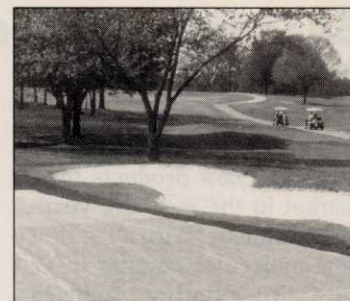
Typar Turf Blankets

creating an environment similar to that found in a greenhouse, which is perfect for turfgrass growth and health. Typar Turf Blankets are porous to allow sunlight, air, water and nutrients, all essential to turfgrass health, through. Tests and practical experience have shown that air and soil under the blankets are three