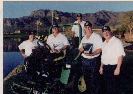
The winning Oshawa Airport Golf Club team.

This year, 725 U.S. teams and 210 Canadian teams participated—earning contributions of $14,500 to the Golf Course Superintendents Association of America's Foundation and $4,200 to the Canadian Golf Superintendents Association's Scholarship Fund.