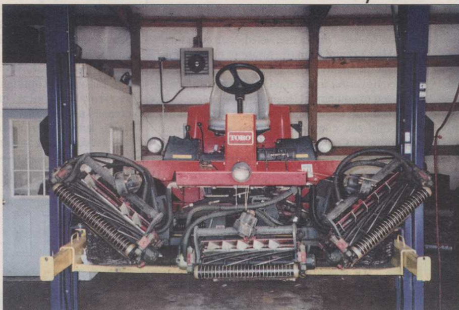
A lift for heavy equipment is a crucial part of the maintenance complex at Country Club of Charleston.