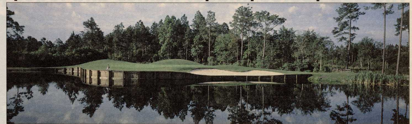
Photos such as The Woodlands Course at Craft Farm in Gulf Shores, Ala. available on OnTee.com.

CARBONDALE, Colo. - Epani, Inc. has announced an autumn roll-out of its comprehensive information technology (IT) system, OnTee.com.