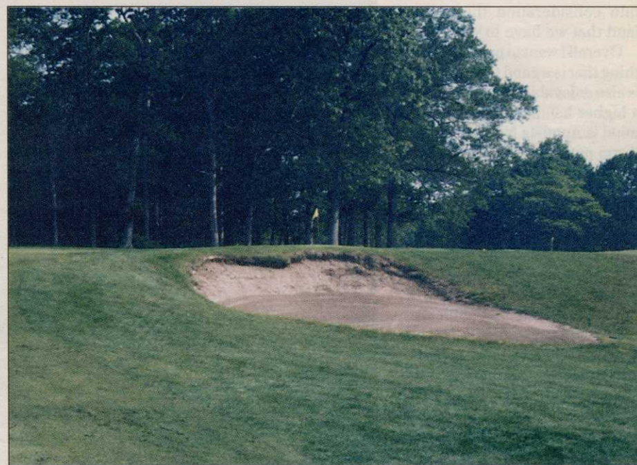
The Rulewich Group restored this greenside bunker on the par-4 4th hole at Yale University Golf Course. The bunker had eroded over the years, time "eating up" the slope. Rulewich installed 500 cubic yards of material and "flashed" the sand on the bunker.