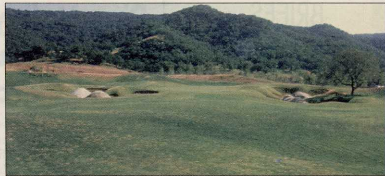
Eagle Ridge GC

The course is part of the 890-home Eagle Ridge master-planned community being developed by Shapell Industries of Northern California, Standard Pacific Homes of Northern California and Gilroy-based Glen-Loma Group.