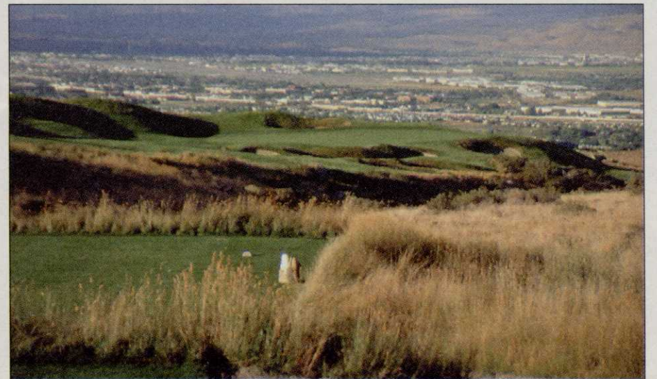
The par-3, 17th "Peninsula," sets against the city backdrop. The tee takes a commanding view of the valley below. At 251 yards from the back tee, many rounds may be saved or lost here.