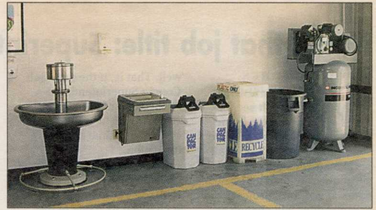
Everything is clean and organized in the natural resource management center.

the far right side, has many OSHA safety covers. They cover the power drive belts that operate the air compressor motor and pump. This soon will be totally enclosed with sound proofing insulation and an appropriate structure, with doorway, Hiers added.