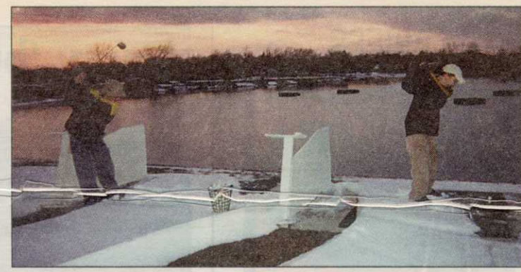
Training up youths is a key to success for practice facilities of all stripes.