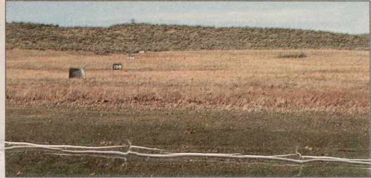
Even simple facilities, throwbacks to long-ago days, should attract practicing golfers.