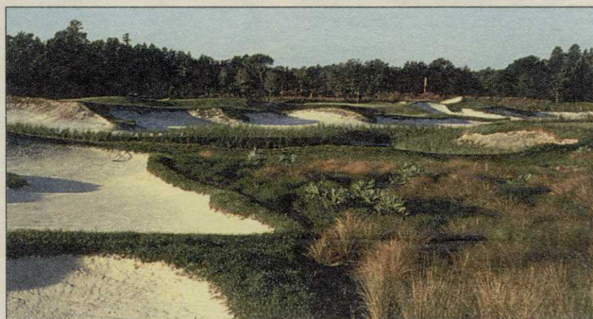
DESIGN & DEVELOPMENT Q&A: Steve Smyers' Old Memorial GC in Tampa is one of the top 10 new private courses in the country. See Q&A with Smyers, page 33.