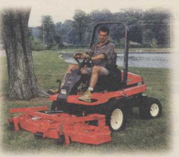
Visiblity and manuverability will increase your productivity.

The durable, independent hydraulic PTO clutch lets you engage and disengage PTO driven imple-