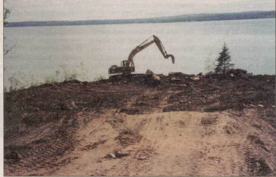
Algonauin Golf Club's 12th hole will be one of several with views of the Atlantic Ocean

The ocean will be visible from almost every spot on the course. The signature hole may eventually be the par-3, 12th, which drops approximately 75 feet from