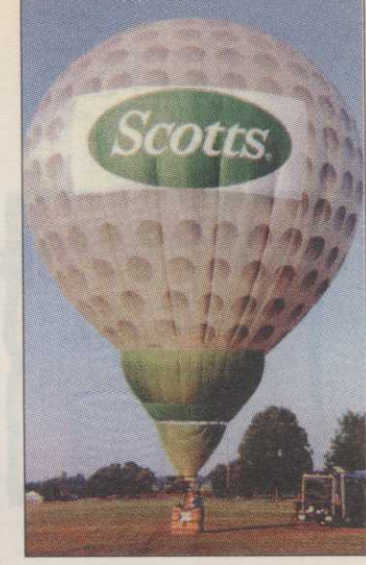
Dimples, the Scott's balloon

Due to more stringent conditions for pesticide use in Suffolk and Nassau Counties (Long Island), MACH 2 liquid and granular formulations will not be available for use or sale in these areas until further notice.