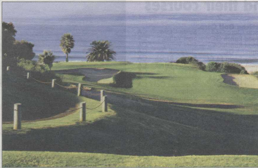
Environmental Golf's Sandpiper GC, also a management firm listing found on pages 54-58.