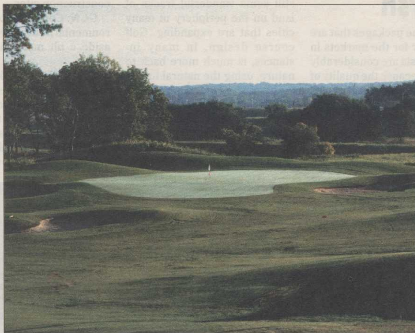
The Craig Schreiner-designed Tregaron Golf Club adds spice to public golf in Nebraska.

With 14 million cubic yards of toxic tailings lurking below the surface, Couples and Bates will have to come up with a low-impact design. The project is headed by a German-based hospitality company known as Ganter USA and will need several levels of approval, from the Environmental Protection Agency and Utah's Department of Environmental Quality to Salt Lake County and Midvale City officials.