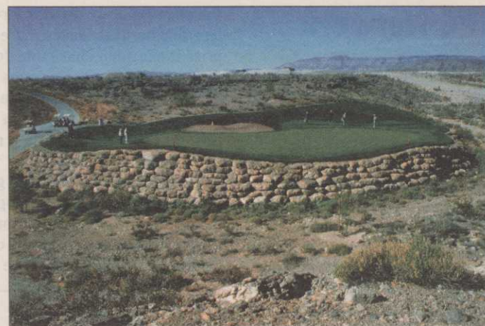
TPC at The Canyons in Las Vegas, which opened in October 1996, is one of the latest in the TPC network.