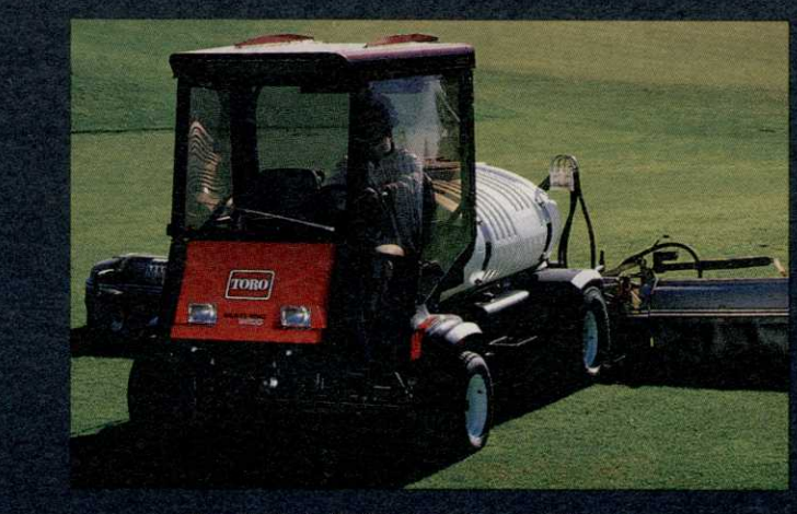
Toro Multi Pro 5500 with new air-conditioned cab.

UNTIL NOW. The world's best sprayer just became the coolest. The Toro Multi Pro® 5500 now comes with an optional air-conditioned cab and a charcoal filtering system that allows cleaner, cooler air to circulate throughout the cab. So spraying even in the worst heat and humidity is a breeze. You can even add the cab to a Multi Pro® 5500 you already have. For more information see your local Toro Distributor, or visit our website at www.toro.com.