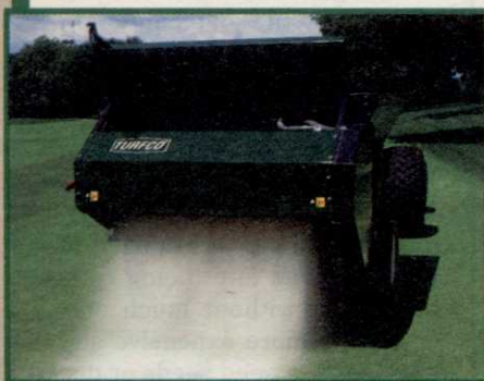
LARGE AREA TOP DRESSING Apply at rates from 1/32" to 4" for golf course fairways and sports fields.