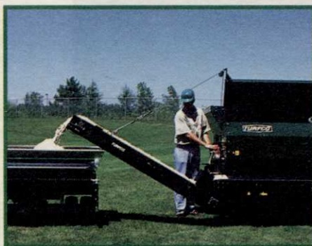
MATERIAL HANDLING Load machines, fill bunkers, move materials for renovation and construction.