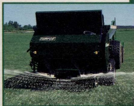
BROADCAST SPREADING Apply from 15' to 40' wide including gypsum, lime, and calcine clays.