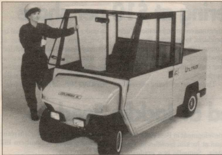
Columbia ParCar Utilitruck