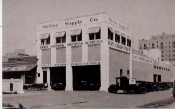
MAIN OFFICE AND MIAMI BRANCH

Early Hector Turf locations in Southeast Florida.