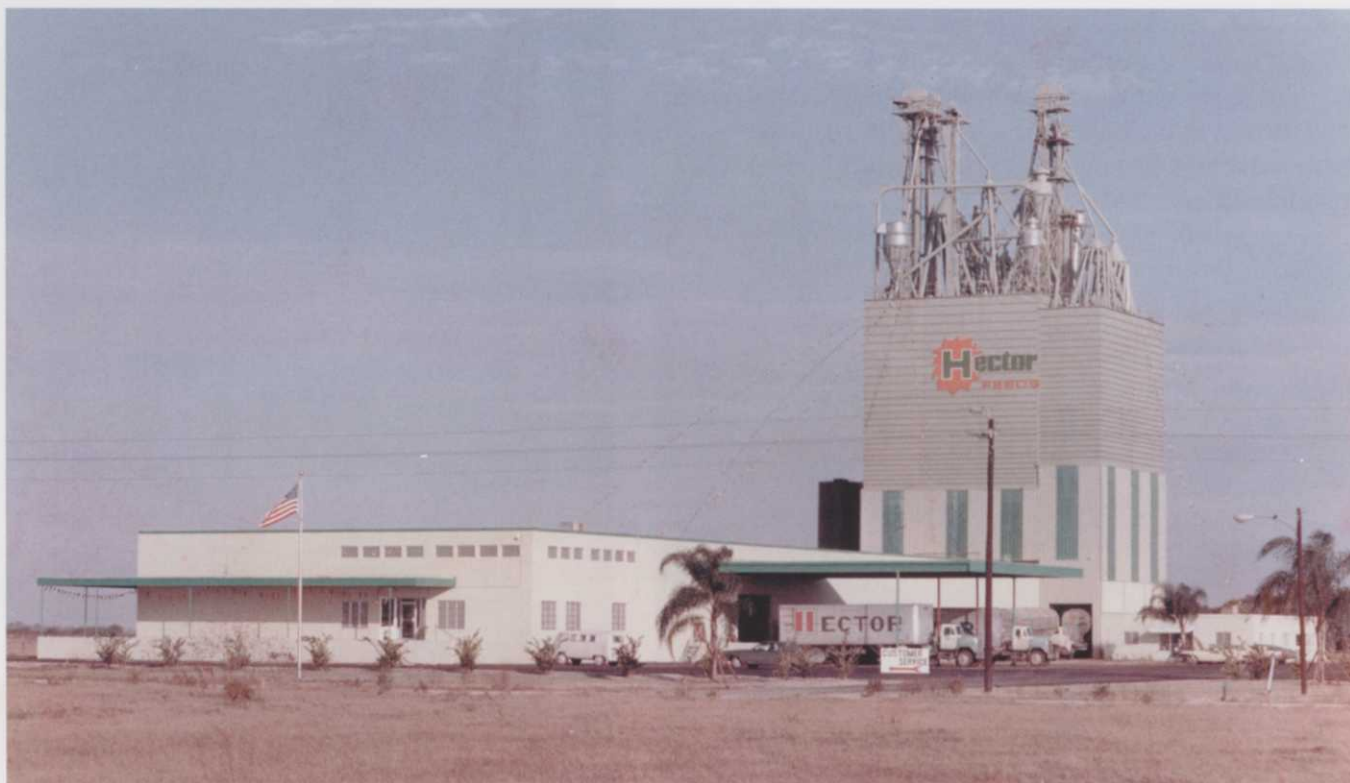
Hector Fertilizer Plant. The company sold its farm supply and fertilizer business interests in 1969.