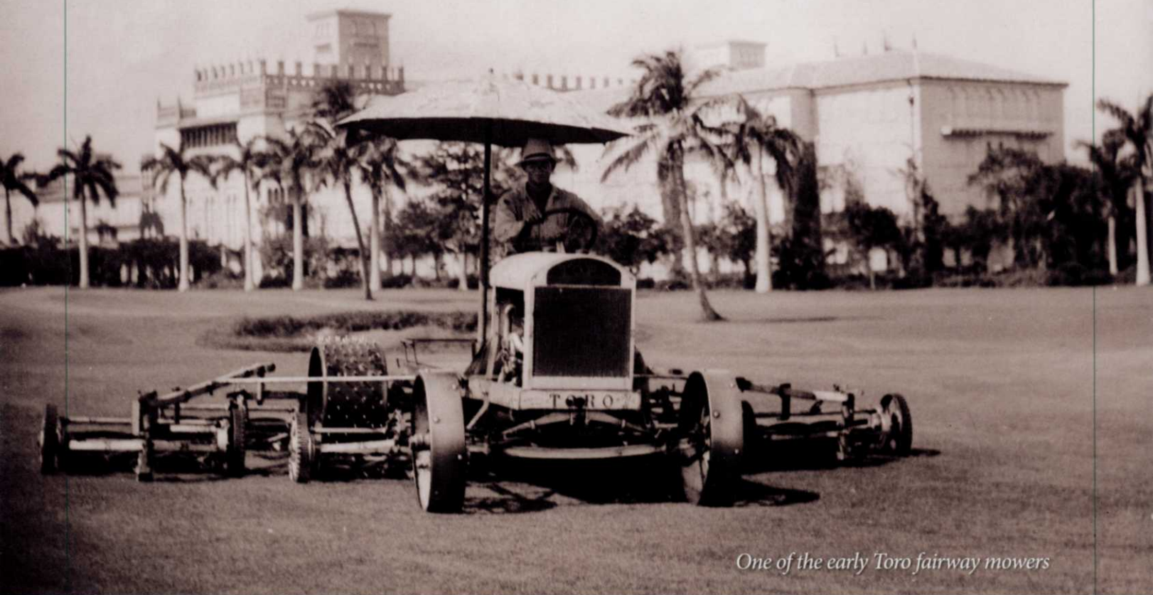
One of the early Toro fairway mowers