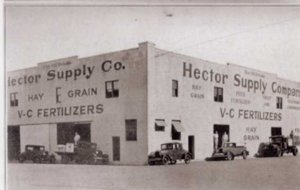
WEST PALM BEACH BRANCH