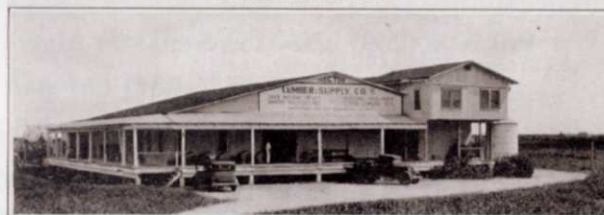
BELLE GLADE BRANCH