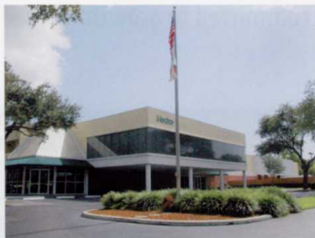
Hector headquarters office in Deerfield Beach.

In 1912, Hector Turf was established as a farm implement and supply company in Fort Lauderdale. Over the years,