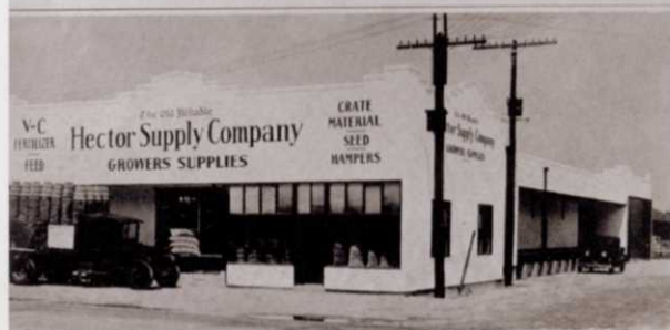
FORT LAUDERDALE BRANCH